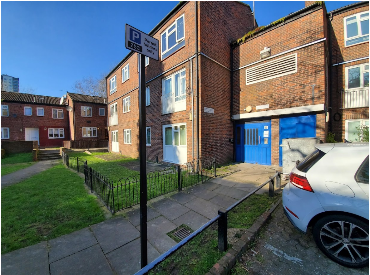
Adjacent residential buildings