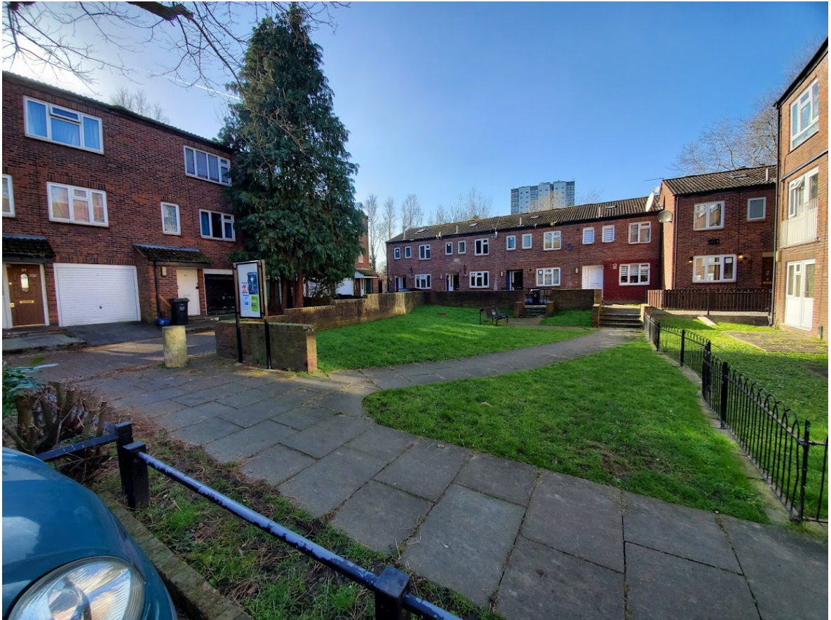
Adjacent residential buildings